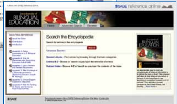
SRO Encyclopedia Homepage