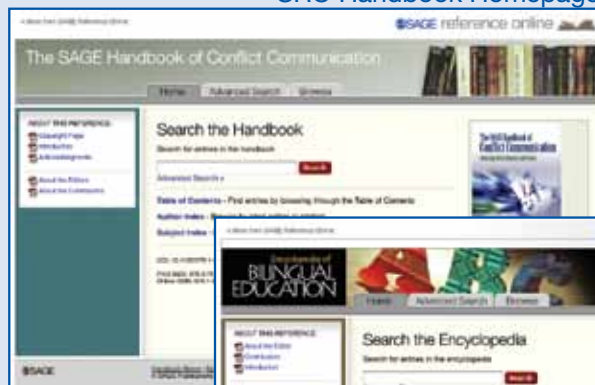
SRO Handbook Homepage